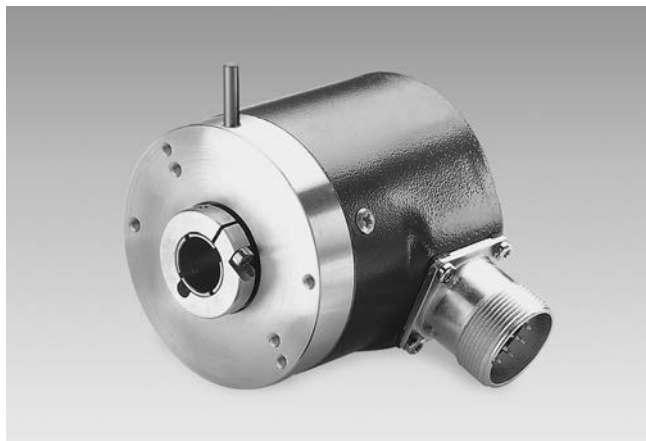
GBP5H with through hollow shaft