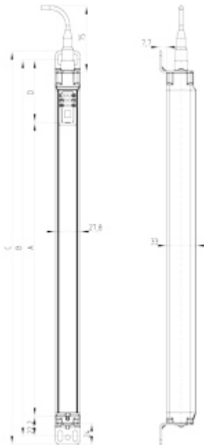
Dimensional drawing (basic component)

K.A. Schmersal GmbH & Co. KG, Möddinghofe 30, D-42279 Wuppertal