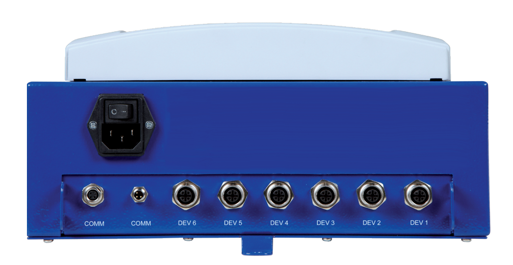
Connection of up to 6 devices