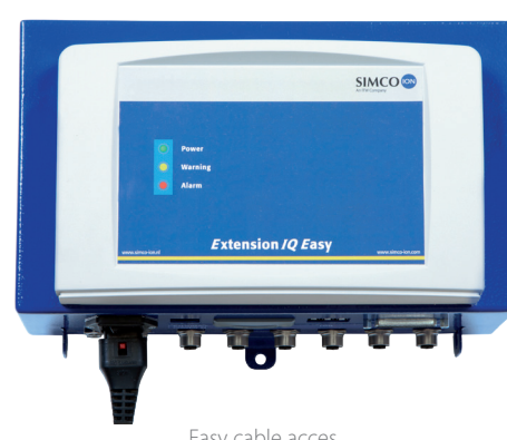
Easy cable acces