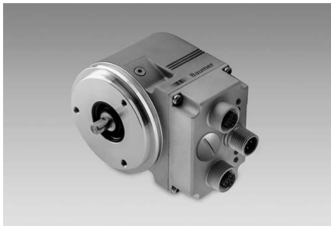
EAL580-SV with synchro flange