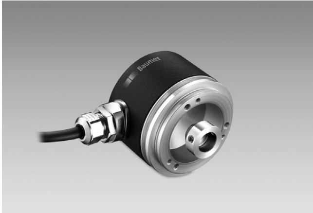
EAM580R Kit with cable