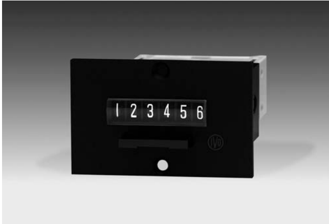
F 514 - Front panel with screw mount