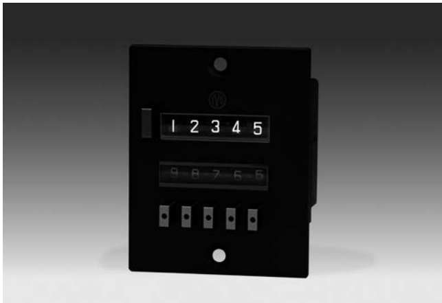
FE314 - front panel with screw mount