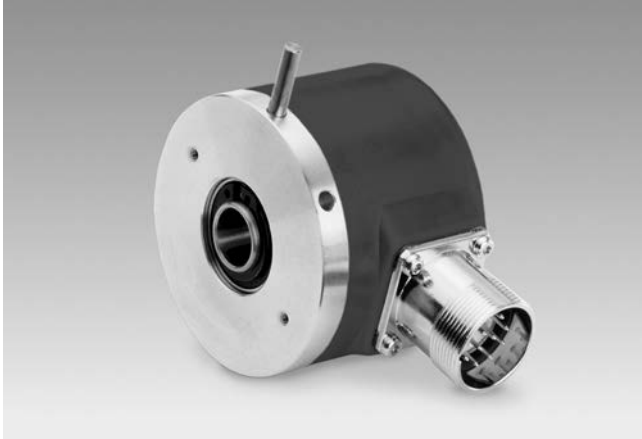
GI330 with blind hollow shaft