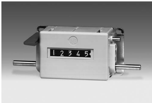
U 410 - Revolution counter