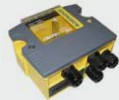
CBX100LT Connection Box