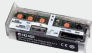
BM100 Backup Module