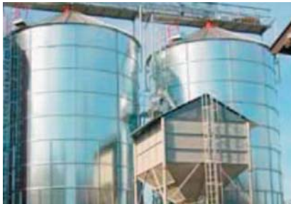
measurement of filling level