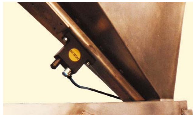
Emptying without bridging