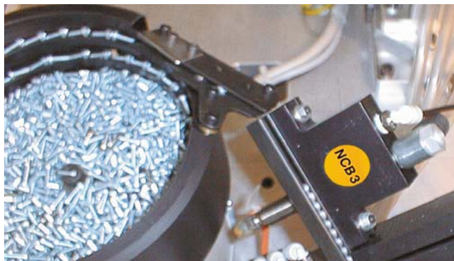
Sorting and aligning

*Dimensions for horizontal mounting, bore ØE