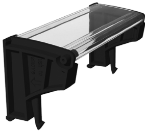
Label carriers for HiC termination boards