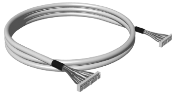
HART Connection Cable, length: 6 m