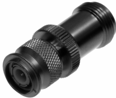
Adapter TNC plug to N socket