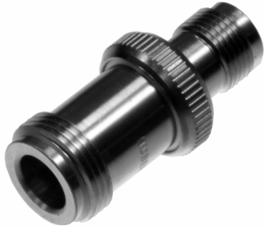
Adapter N socket to TNC socket