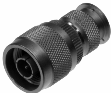
Adapter N plug to TNC plug