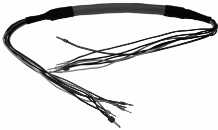
Backplane Connection Cable