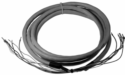
Backplane cordset FB9272, redundancy unit to extension unit (3 m)