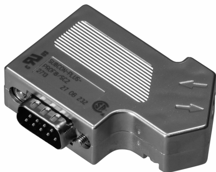
D-Sub plug 9-pin, cable feed below 35°