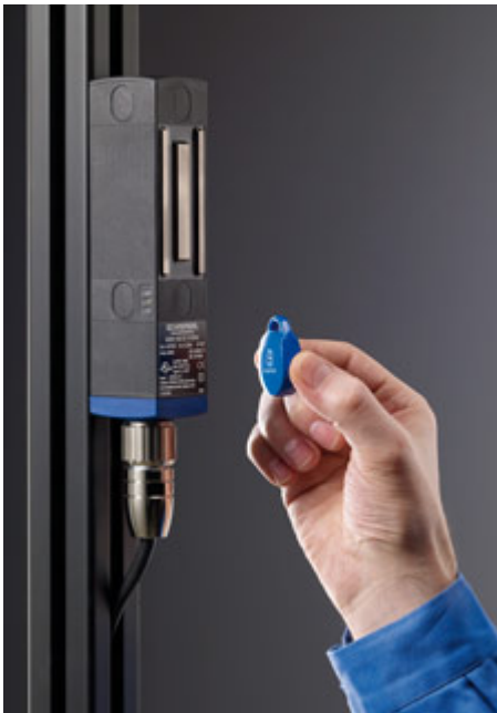
Product in the environment