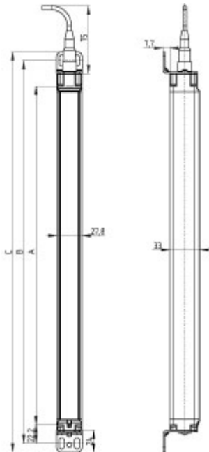
Dimensional drawing (basic component)