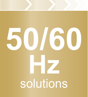
Higher nominal outputs are possible through new 60 Hz solutions